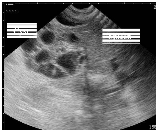
Fig. 1 Ultrasound aspect of the cyst.