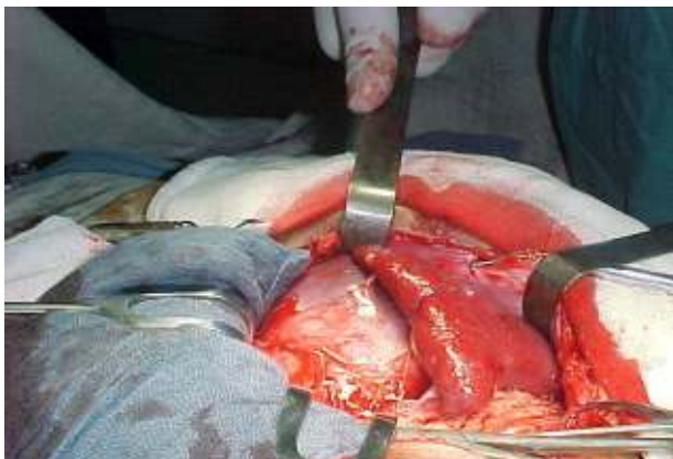
Fig. 2. Exposing the cyst in the superior part of the spleen