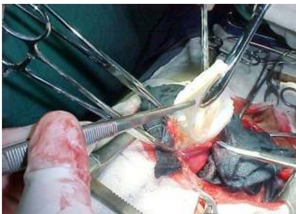
Fig. 4. Extraction of the germinal layer