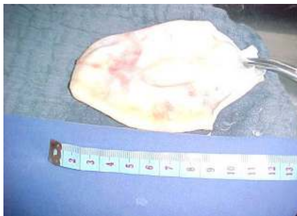
Fig. 5. The aspect and size of the germinal layer