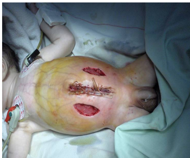
Figure 5: Closure of the abdominal wall.

The patient was supported with a ventilator for about 12 hours, then weaned to supplemental nasal oxygen at 1 week. The infant was initially maintained on peripheral total parenteral nutrition (TPN). Nasogastric suction was discontinued at 1 week and gesol solution begun, with the