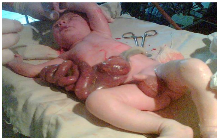
Figure 1: Typical gastroschisis with the hole just to the right of the umbilical cord.

The baby looks normal at birth except for matted intestinal loops and the stomach coming through an anterior abdominal wall defect just to the right of the umbilical cord. The stomach, small bowel, and large intestine was outside of the hole. The bowel is matted, swollen, and shorter than normal. The loops were very edematous and don't resemble normal intestines (fig. 1).