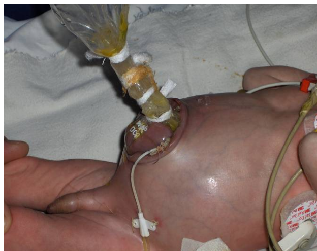
Figure 3: A newborn with gastroschisis with a silimed gastroschisis container of five cm. diameter- a 8-th day postsurgical.

Once the intestines are almost all back inside (this process was completed after 9 days in this case), the infant was returned to the operating room for closure of the gastroschisis (O.P. 1874/17.10.2005)