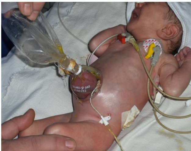
Figure 2: A newborn with gastroschisis with a silimed gastroschisis container of five cm. diameter- a 6-th day postsurgical.

The intestines was returned to the abdomen gradually by gentle pressure and placing the string which ties off the top of the silo gradually lower on the silo at the bedside in the NICU (fig.2,3).