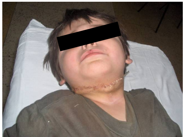
Fig. 4. Postoperative aspect.

The histological finding revealed fibrolipoma, a histological variant of lipoma. The patient had a very good recovery with satisfying neck contour and intact blood vessels and vagus nerve. Tumor recurrence was not observed 6 months after surgery.