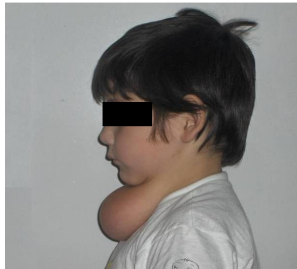
Fig. 1. Pediculate lipom of the anterior neck – clinical aspect.