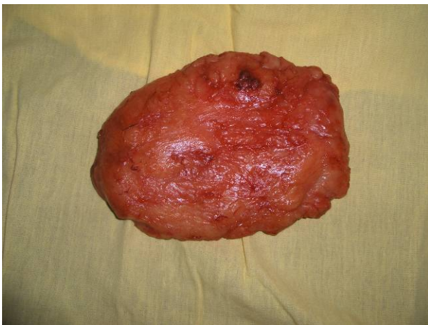
Fig. 3. Resected lipoma.

followed by excision of the excess skin. Hemostasis by electrocoagulation, drainage tube.