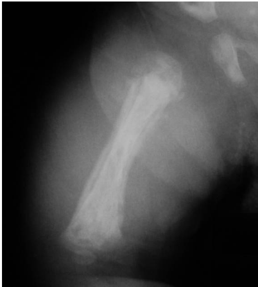
Fig. 1. Preoperative radiological aspect.

In view of clinical findings baby was admitted and scheduled for surgery the next day. Patient was placed on i.v. fluids, i.v. antibiotics, antithermic and vitamins.