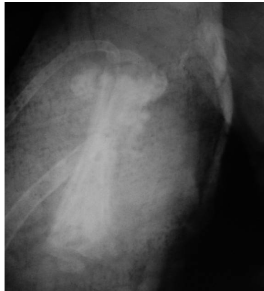
Fig. 2. Postoperative radiological aspect.

Cut down of upper ½ of the right femur (epiphysis, metaphysis and diaphysis) through the soft tissues. Periosteum was detached from bone. Pus was found under considerable tension posteriorly. Culture sample was taken, wound washed thoroughly and drained with 2 drainage tubes one placed superiorly through the greater trochanter and the other placed inferiorly at the diaphysis (fig. 2). The upper tube was used for flushing while the low tube was used for drainage.