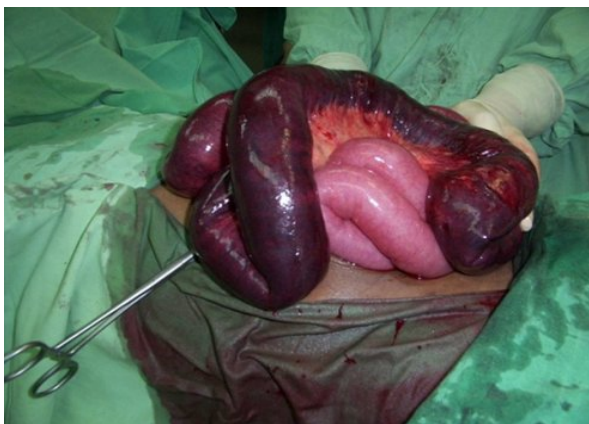
Fig. 2 Intraoperative aspect.

It entered on a xifopubiana incision, and on opening the peritoneum poured a significant amount of sero-bloody fluid. In the small pelvis was discovered a cluster of bowel loops, black, non viable, with walls edematiate edema filled with blood clots "heavy" because of the content, and the display of necrotic bowel was found that is the chance that the small intestine which corresponded to a necrotic mezou mesentery , in up, based at the mezostenica mesostenic edge of the bowel and the top by the root of mesentery (Fig. 2).