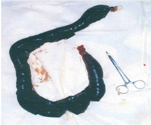
Fig. 3 Snare resection.

terminal in a layer, and bowel resection was sent to the pathological examination (Fig.3).