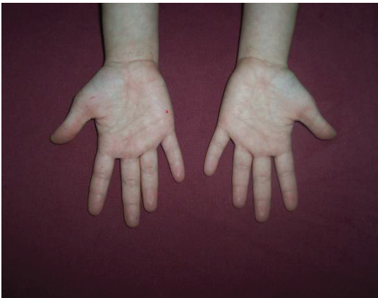
Figure 3. Fifth finger clinodactyly.