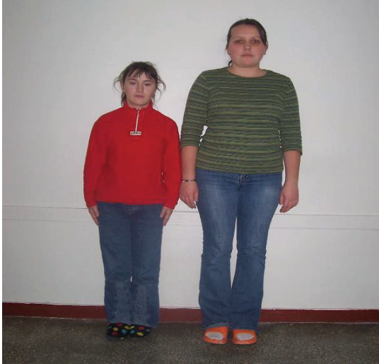
Figure 1. Staturponderal delay.

Genetic consult: particular phenotype, oblique palpebral fissure, hypertelorism. Narrow forehead, septum deviation. Geographic tongue (Fig. 2). Slow writing, chaotic dermatoglyphism, fifth finger clinodactyly (Fig. 3).