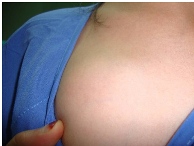
Figure 2: View of preoperative of the patient.

capsula of cystic mass was perforated and seen germinative membrane with cystic liquid. Therefore a sponge soaked in povidone- iodine was placed around the mass and cystic lesion was removed totally with capsule. The cavity was irrigated with povidone- iodine, and followed with saline. Histopathological examination confirmed the presence of hydatid cyst. Albendazole 15 mg/kg was given for 3 months. Further investigations were performed to identify additional HC in different regions, but none were found. No recurrence occurred for 12 month follow up.