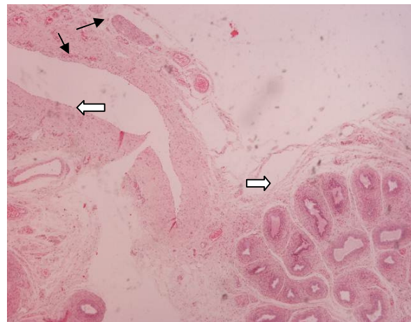
Picture 4: Surgical specimen of cryptorchidism. Epididymis (right arrow), vascular connective tissue (undeveloped testis) (left arrow) and thin stroma of mesothelial cells that line visceral tunica vaginalis. (thin arrows H-E x400).