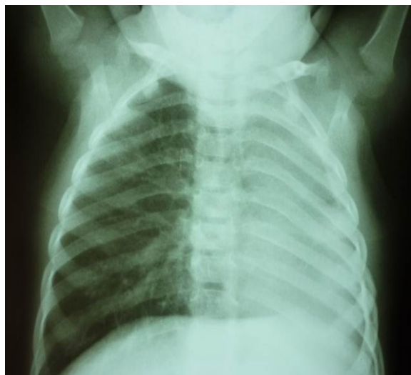
Fig.5 4 mounts, a radiology control