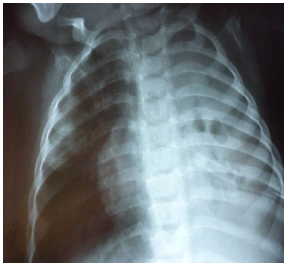
Fig.2. Left lung half is almost completely dimmed. Presence of inflammatory changes in the pulmonary parenchyma with taking on the pleural cavity