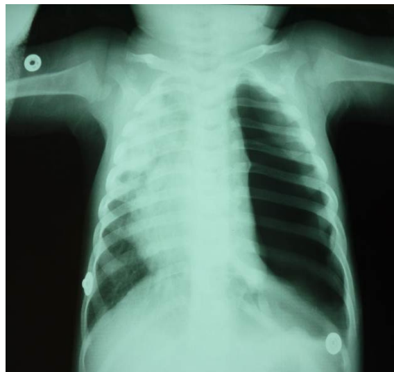
Fig.1 Total left-sided pneumothorax