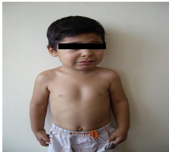
Fig.6 After 4 mounts physical examination