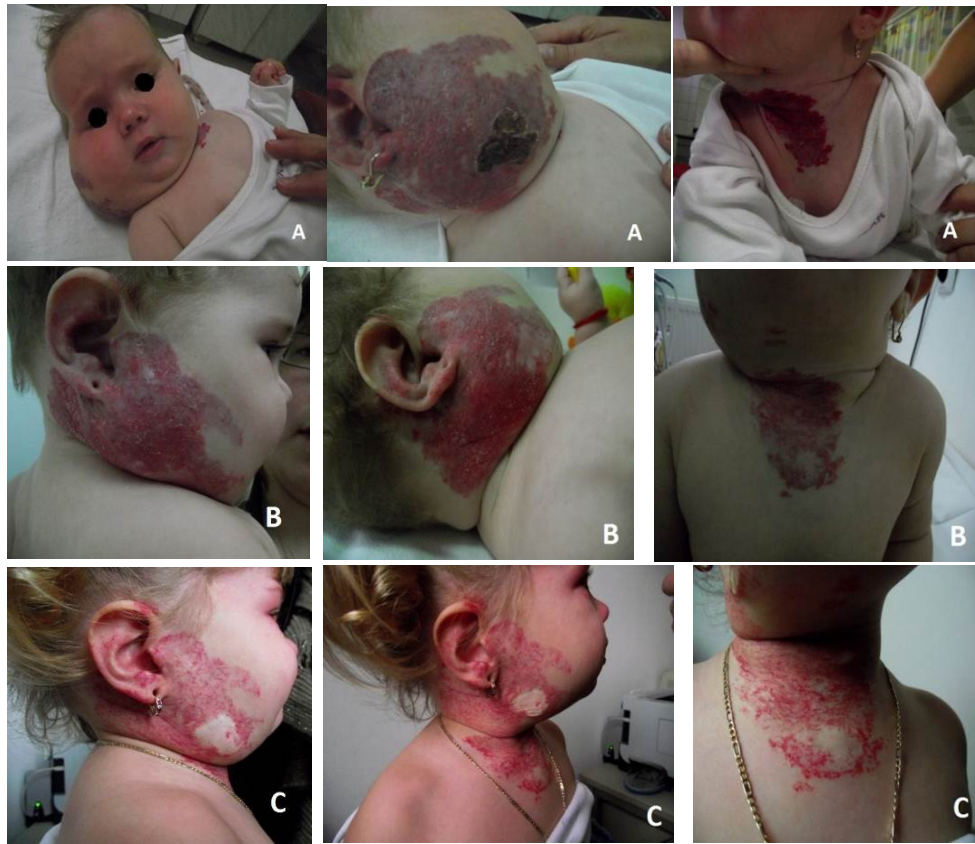
Fig. 5. Case 5: A. Before treatment B. After 10 week; C. After 14 months.

The outcome of each lesion was defined by its status at the last recorded patient visit. Outcomes are classified as: 1-very good if the final observation indicates that the lesion has more than 90% disappeared, 2-good if the lesion has more than 70% disappeared, 3-partial if the lesion has less than 50% disappeared, 4-early removing from study by parents.