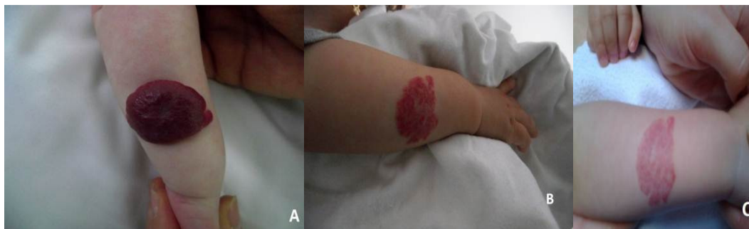
Fig. 2. Case 2: A. Before treatment with Propranolol; B. After 9 months; C. After 12 months.