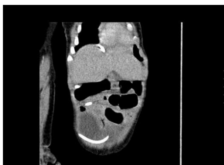
Fig. 2. Contrast enhanced CT scan of abdomen showing the tip of the peritoneal within the mass