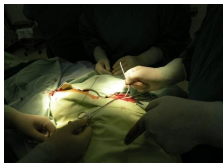
Fig. 3. Operative photograph showing the intraperitoneal repositioning of the shunt